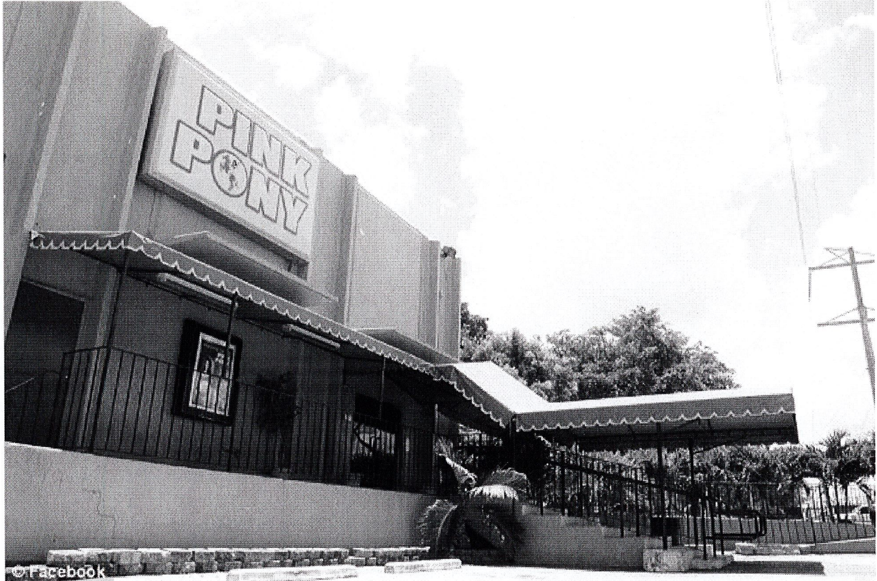
The investigation first began after the 17-year-old's mother found photos and videos that showed both girls at the club on her daughter's cell phone

Police said she also admitted to drinking and doing drugs inside the club.